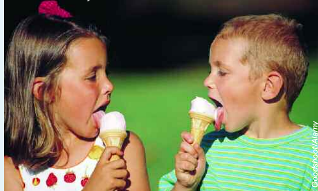
Children love soya ice cream!

Rice & Rice – organic rice dessert available in vanilla, cocoa and caramel.